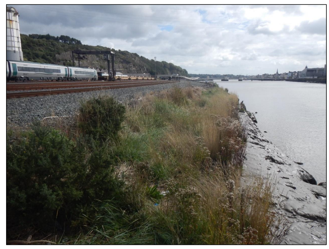
Plate 3.1 Study Area – View east towards Plunkett Station and Rice Bridge from the west

The study area of the proposed development is located on the north bank and within the foreshore of the River Suir in Waterford City and is bound to the north by the existing road infrastructure and the larnród Éireann railway corridor serviced by the Plunkett Station, the Waterford railway station. Plunkett Station is bounded to the north by a steep rock slope which is subject to rock stabilisation works as part of the overall Waterford City Public Infrastructure Project. To the south, the railway corridor is bounded by the existing quay wall and the River Suir as shown in Plate 3.1 below. The assessment of alternatives was limited to the northern bank of the River Suir, where Plunkett Station, its associated rail infrastructure and Rice Bridge Roundabout are located.